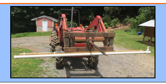
10.5 ft. tractor-mounted OR 8 ft. ATVmounted weed wipers $20/day *