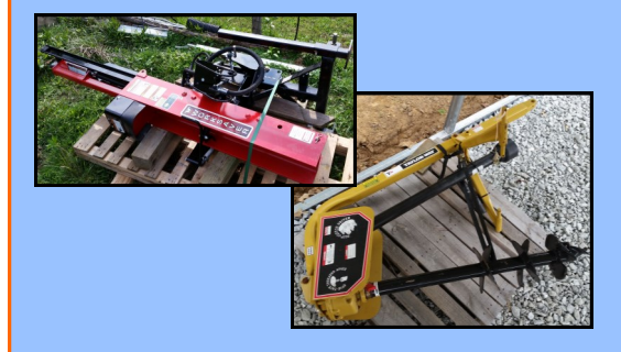
Post driver $40/day * OR post auger $30/day *