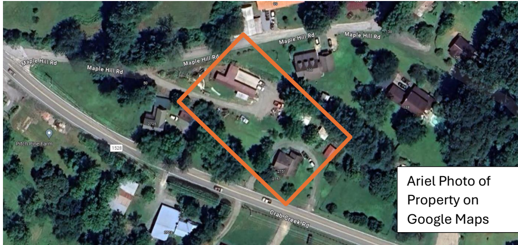
View from Maple Hill Rd