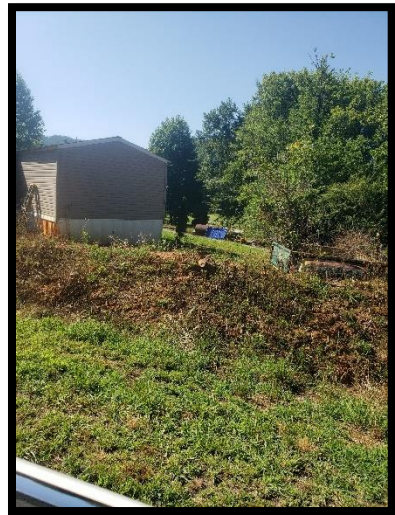
Headed toward Crab Creek Road on Maple Hill Road