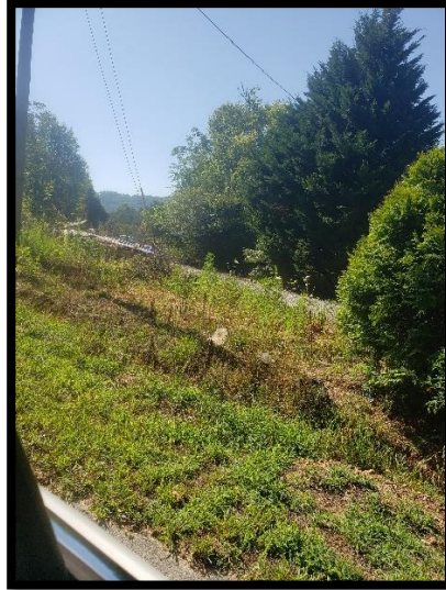
Headed from Crab Creek Rd on Maple Hill Road