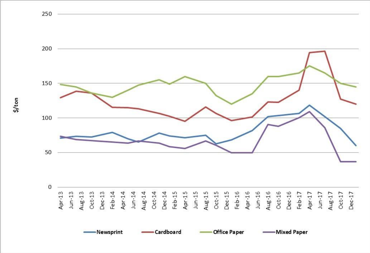
Five Year Pricing Trend for Recyclable Fiber Commodities