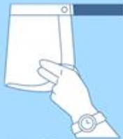
Full-face Face Shields