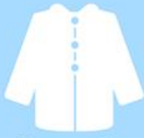
Protective Procedure Gowns One Size Fits Most XL XXL