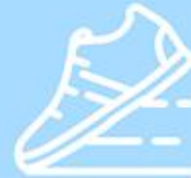
Disposable Shoe Covers

Questions? Give us a call at 884-3151 x2.